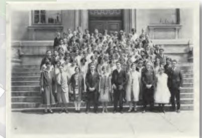
Germantown High School Class of 1926.