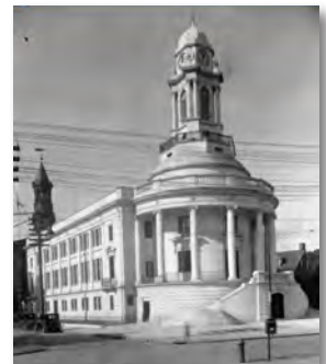
Germantown Town Hall shortly after completion, 1925.