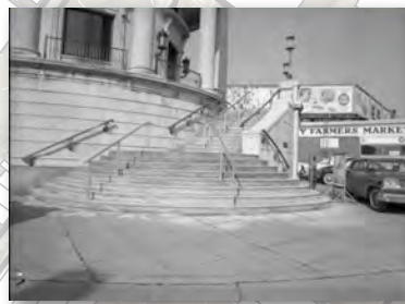
View of steps and railings at Town Hall, 1961.