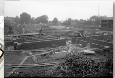
Germantown High School under construction, 1914.